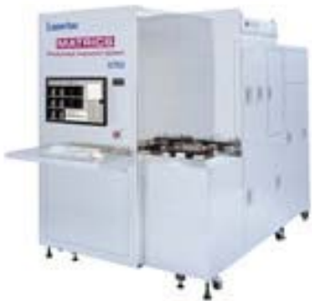
Photomask Inspection System MATRICES X700 series