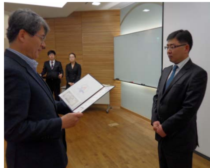
Lasertec Korea Corp. receives the Certificate of commendation